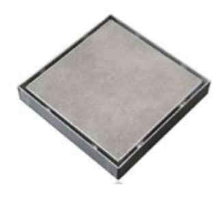
Floor waste: Suttor Tile Insert 100x100