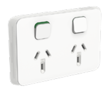
3025 Clipsal Iconic double GPO