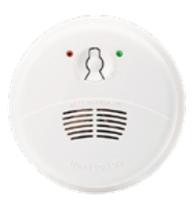
755PFM4 Clipsal Flush Recessed Mount Smoke Alarm