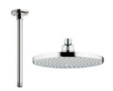
Shower outlet: Posh Vertical with Posh Domaine 220 round overhead