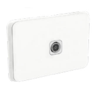
3041VTV75F-VW Clipsal Iconic TV PAL Antenna Socket Plate