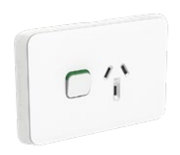
3015 Clipsal Iconic Single GPO