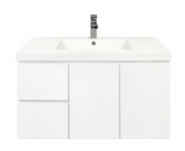
Vanity: Forme Mont Albert Wall Hung